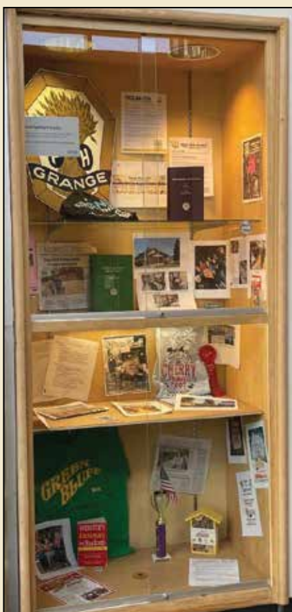
Green Bluff Grange Display for Grange Month at the Spokane Library.