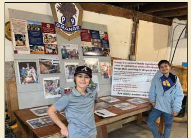
Pictured is the Grange Month Display by Fargher Lake Grange in Clark County.