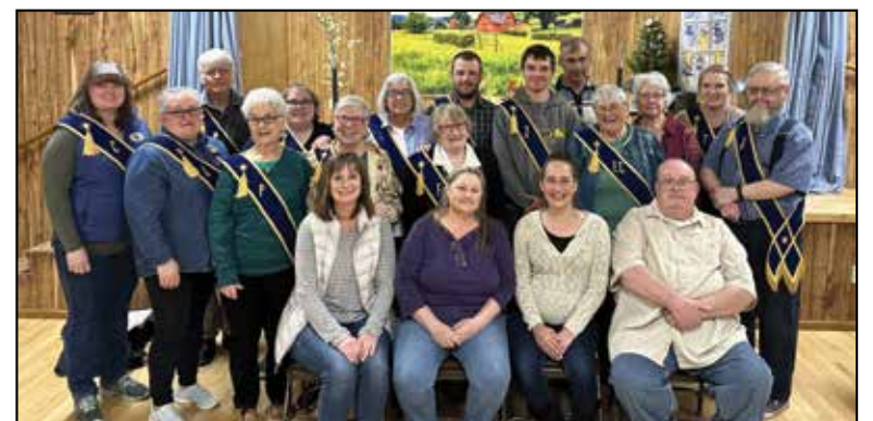
(TOP) Pictured is the Snohomish County Pomona Grange 5th Degree Team. On Sunday, April 14th, we welcomed six new members to our Pomona Grange after the exemplification of the Degree of Pomona at South Lake Stevens Grange Hall. (Bottom) Klickitat County Pomona Grange exemplified the first Four Degrees on Saturday, April 6th, at the Centerville Grange Hall. Klickitat County has seven Granges showing they are continuing to be #GrangeStrong!