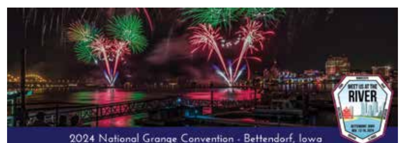
2024 National Grange Convention - Bettendorf, Iowa

We are excited to launch registration for the 158th Annual National Grange Convention in Bettendorf, Iowa, hosted by the Midwest Region.