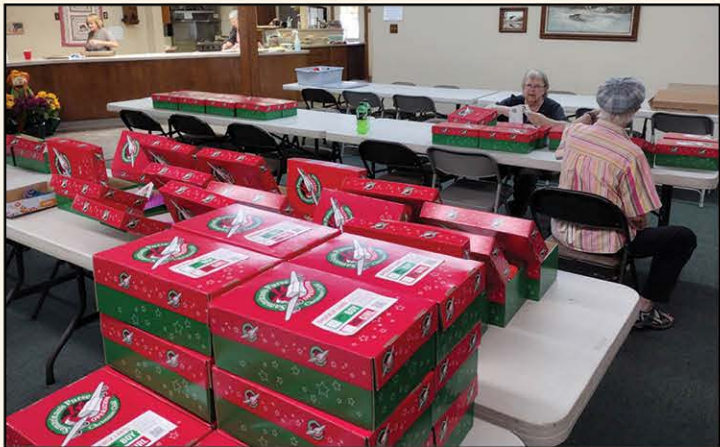
Barberton Grange members filled 50 shoe boxes this year for Operation Christmas Child. This was the first time filling boxes and we all had a great time. The boxes contained a variety of toys and games as well as one of our handmade Christmas cards. We are looking forward to being a part of this project next year.