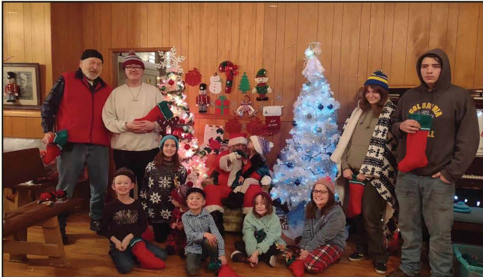
Greenwood Park Grange hosted a community Christmas dinner and Christmas program.