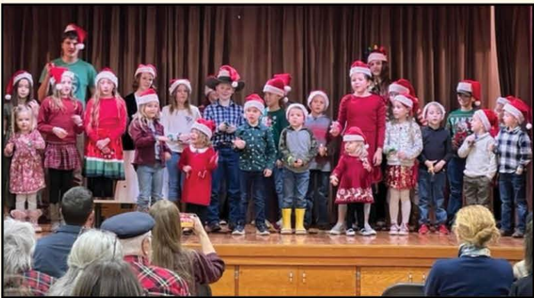
Ralston Grange held their 92nd annual Community Christmas Party on Dec. 3rd with over 100 attending. Families from all the eastern Adams County communities were present in spite of a night of heavy fog, which didn't stop Santa from paying a visit too.