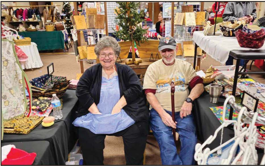
Addy Grange #603 holds two "Home for the Holidays" craft fairs each year, one in November and one in December. Our 21 vendor spaces hold leather arts, woodworking, fiber arts, jewelry, ceramics, floral arts, and even an author of children's books. Our Junior Grangers participate with baked goods, crafts and an annual swag sale. This year, not only did Santa visit us, but we also had an appearance by the Grinch himself!