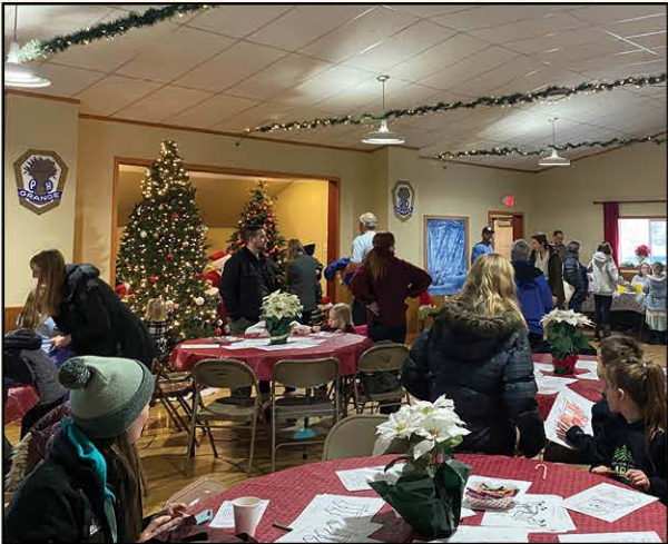
On Saturday, December 2nd Five Mile Prairie Grange held their annual Pancakes with Santa and welcomed over 300 friends and neighbors who braved the winter weather to attend this favorite community event. Thanks to our sponsor, TDS Fiber for their continued support.