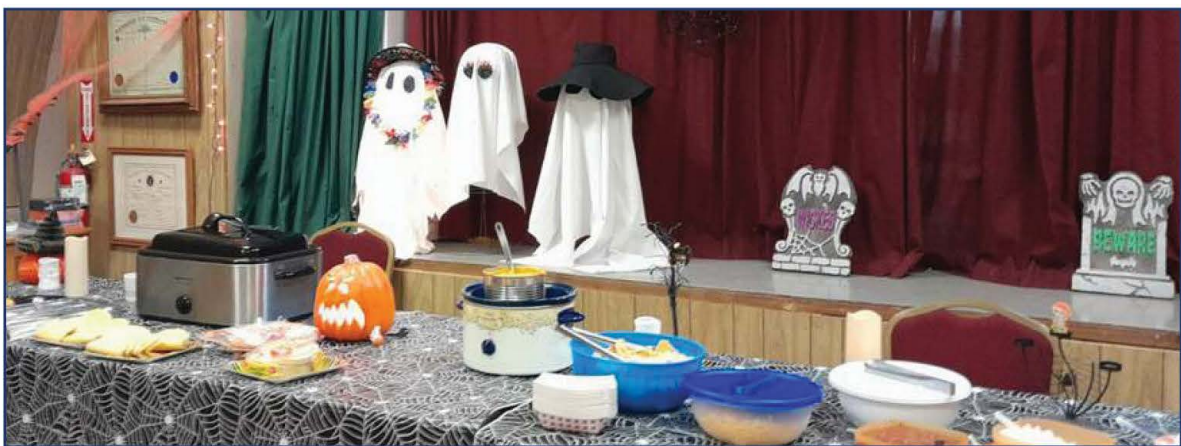
A Trunk or Treat was held October 31st at Stranger Creek Grange. They were treated to a fire engine and fire fighters from SCFPD #12 who provided treats and information about the fire district. Kids "trunk or treated" cars outside, then headed inside for a taco bar, games and a cake walk. Everyone had a ghoulishly good time.