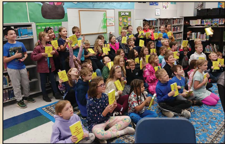
Fertile Valley Grange in Pend Oreille County presented dictionaries to 50 students at Chattaroy Elementary School on October 20. They also presented 60 dictionaries to Riverside Elementary School on November 3.