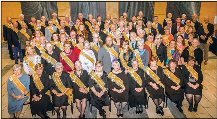
Officers and Delegates of the National Grange pose for their annual photo at the 157th Convention of the National Grange on November 15th. What a great group of Grange leaders!