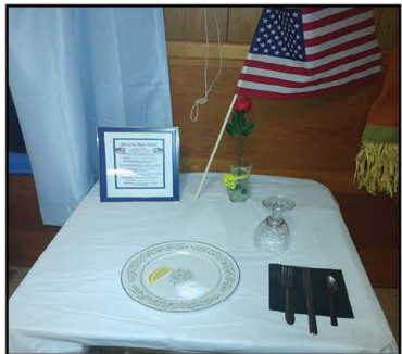
Greenwood Park Grange in Stevens County recently hosted a community Thanksgiving Dinner and Veterans Day Program. There were over fifty people in attendance.