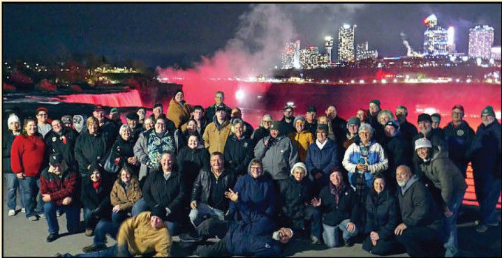
Grange members take in the nighttime view of Niagara Falls.