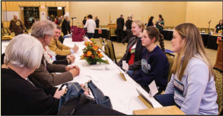
National Grange Officers take the time to meet and mentor Youth members during their time at the National Grange Convention.