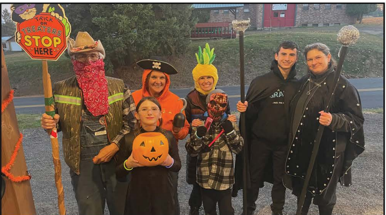
Green Bluff Junior Grange hosted a Halloween Candy Drive-Thru on October 28th.