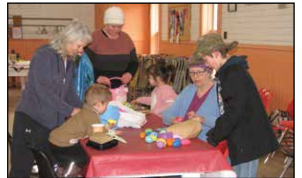
Malo Grange held an Easter Egg Hunt in April. (Left) On the run to gather those eggs! (Right) Helping sort the loot!