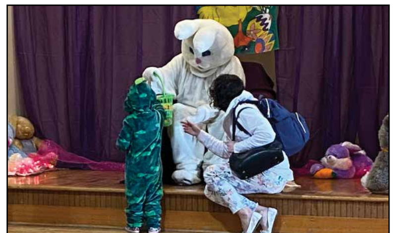
Five Mile Prairie Grange #905 served their annual Pancakes with the Easter Bunny breakfast in April. Families always enjoy getting pictures with the Easter Bunny!