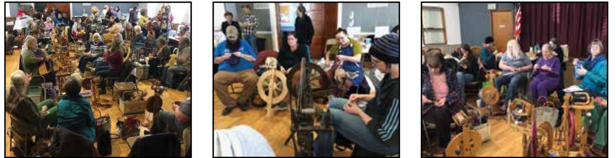
Spin-In Event at Green Bluff Grange in Spokane County. The event raised $500 for the Grange Scholarship Fund.