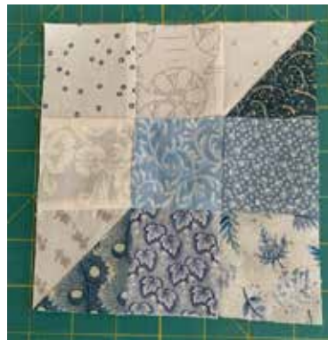
Finished Quilt Block

Questions? Email lecturer@nationalgrange.org for guidance.