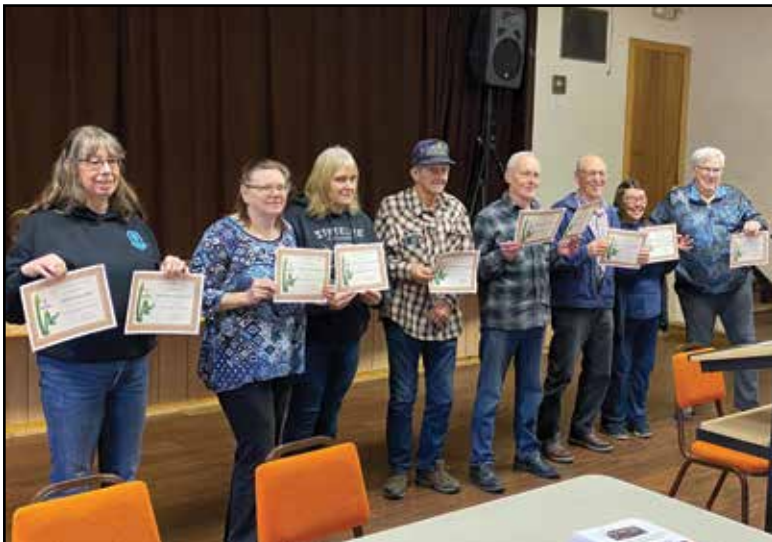
Granges from Stevens and Ferry County were awarded "Grange in Action" recognition by the National Grange. The certificates were presented at the Grange Resource and Leadership Conference in January.

★ ★ ★ MARK YOUR CALENDARS! ★ ★ ★ WASHINGTON STATE GRANGE ANNUAL CONVENTION JUNE 21-24, 2023 • GRANT COUNTY FAIRGROUNDS, MOSES LAKE