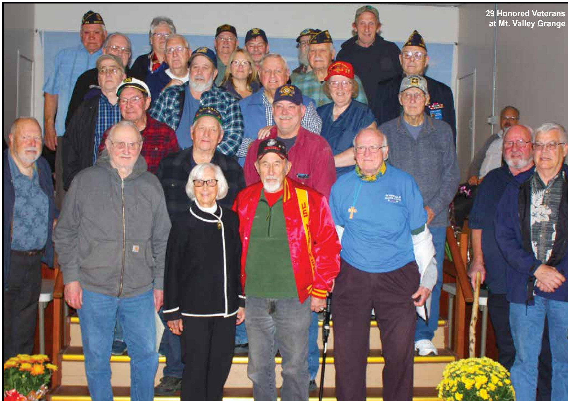
29 Honored Veterans at Mt. Valley Grange