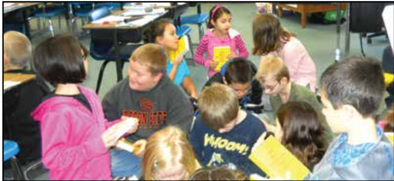
On January 28, 2020, members of Goldendale Grange #49 distributed dictionaries to the third and fourth graders at Goldendale Middle School.