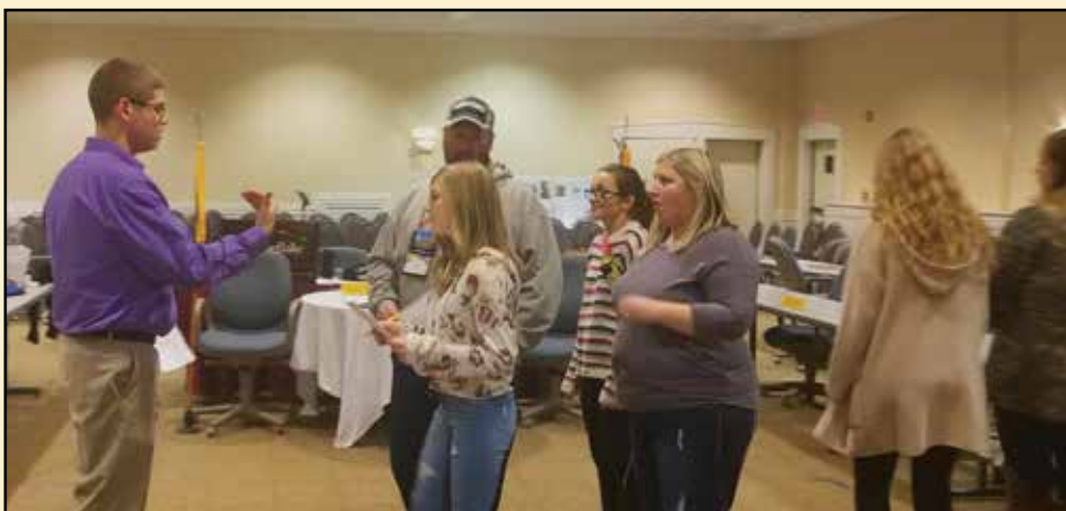
The 2018 National Grange Youth Officer Team rehearsing their opening drill.