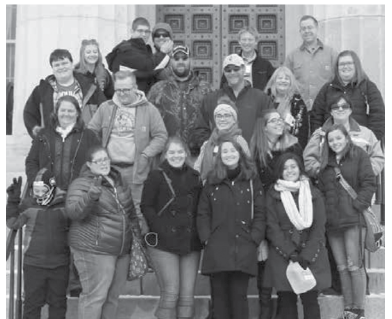
Youth visited the Vermont State Capitol building on Thursday as part of the tour.

history of the phrase of "costing an arm and a leg", is from the variety of cost of self-portraits. Apparently, painting hands is a challenge, as is the placement of feet, so those paintings cost much more than a simple head and shoulder portrait.