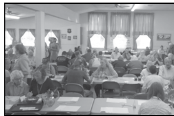
Ice Cream Social