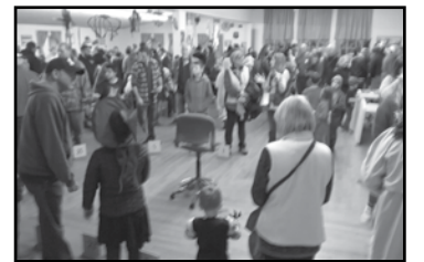
Country Fair and Pumpkin Party